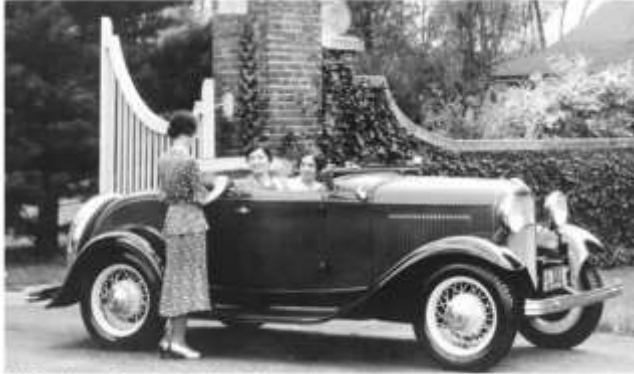
1932 Ford Phaeton Roadster (Ford Motor Company)

If you own a 1933 or 1934 Ford, you'll want to be a part of the Model 40 Convention to be held March 8-10 next year .