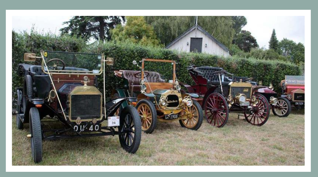
National Veteran Rally - Marlborough February 2025

Veteran Rally Heritage Day Vine Village Market Picton Picnic