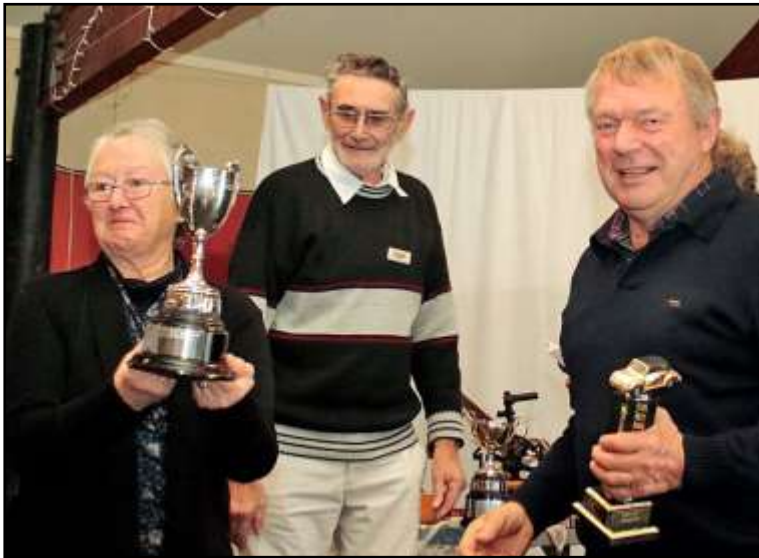
Popular Vote Trophy – G & M Buick – 1948 Buick and Pierce Trophy – G & M Buick – 1948 Buick