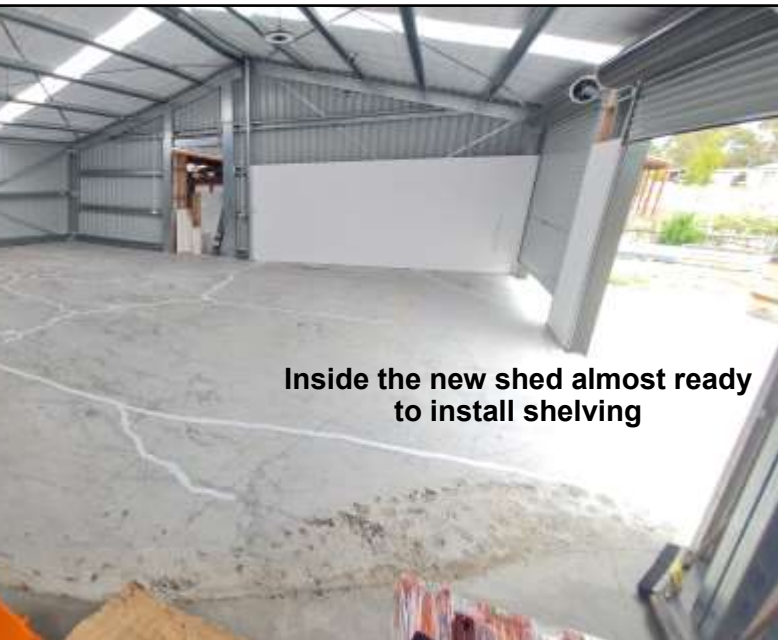
Inside the new shed almost ready to install shelving