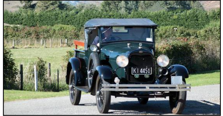
ASHWOOD PARK RETIREMENT VILLAGE APRIL 2025