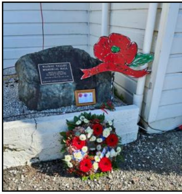
WAIRAU VALLEY TOWNSHIP ANZAC DAY 2025