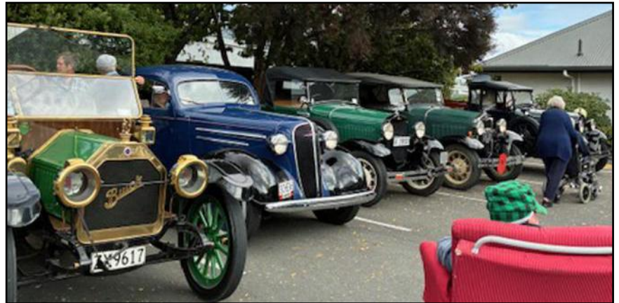
FLAXBORNE HERITAGE CENTRE OPENING