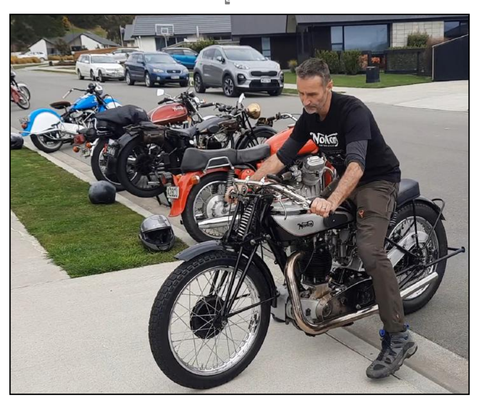
1927 Norton - as seen on the latest Shed Visit by the motorcycle section