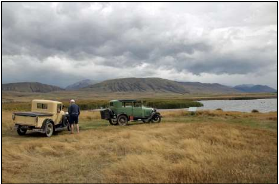
Model A's Rally in Methven